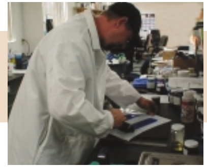
Custom Color Matching