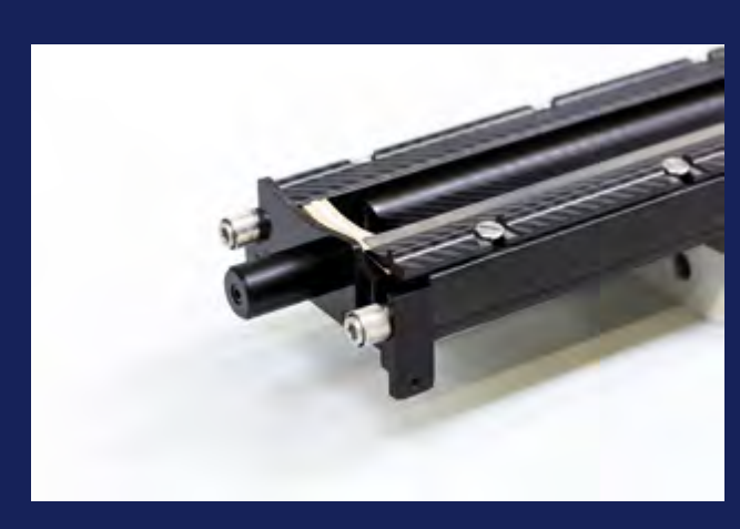
High quality components enable outstanding printing results: here using the example of our carbon fibre doctor blade chambers