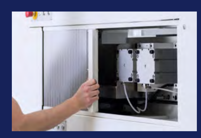
Set-up of printing units not in use at full production speed with A CHANGE