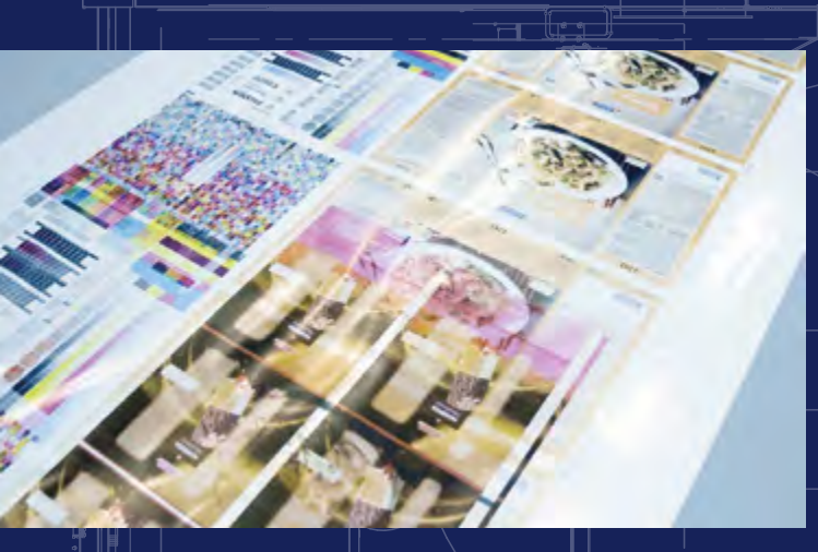
Job changes at the touch of a button and almost no waste with our "Change on the Fly"-mode

Realize your own non-stop production. With our A CHANGE technology.